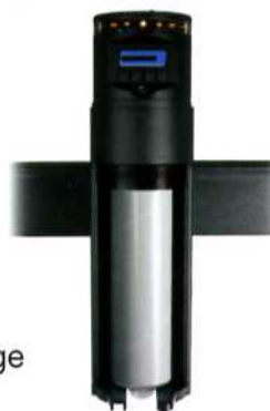
2 kg Cartridge