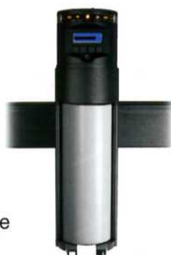
8 Lb. Cartridge