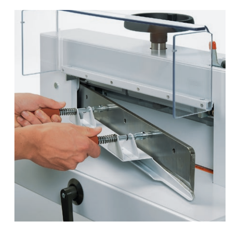
SAFE BLADE CHANGE

The precise measuring scale (mm / inches) located on the front table of this guillotine allows precise positioning of the backgauge.