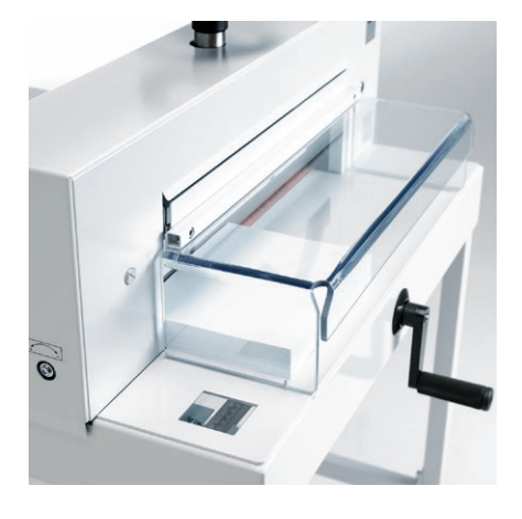
TRANSPARENT SAFETY GUARD

A cut can only be executed, if the safety guard is closed and the safety catch for the blade lever is released.