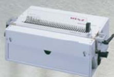
DTP 340 A