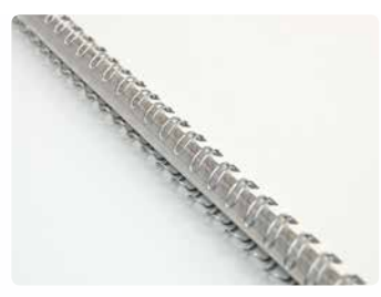
Now you can easily remove the opened binding wire.

If any additional pre punched sheets are required they can now be added and re bound using a new colour or binding element.