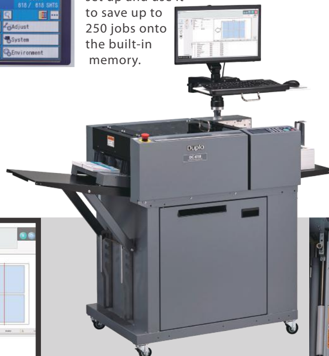
DC-618 shown with optional PC and PC arm.

to save up to 250 jobs onto the built-in memory.