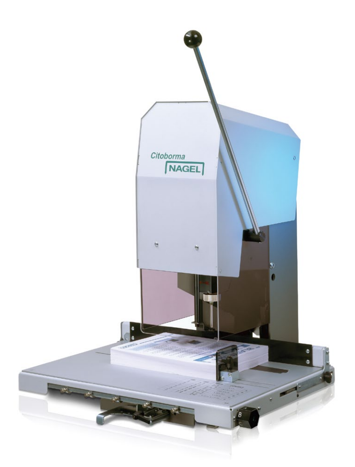
NAGEL-Citoborma 190 table top

The FlexoDrill<sup>o</sup> sliding table releases automatically after each stroke. It can be fixed at any position if required and the individually programmed tabulator bars are interchangeable. These remarkable features are suitable for multi-purpose applications.