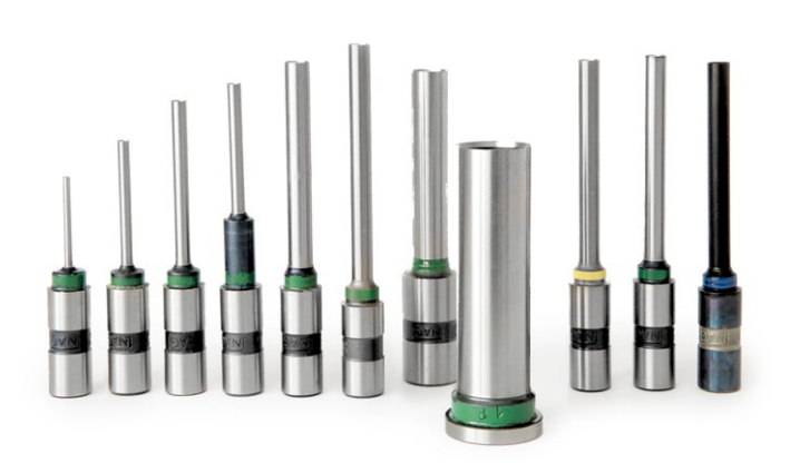
Nagel paper drill bits: 2 - 35 mm diameter, 30 - 60 mm working length, and special designs on request

Constantin Hang Maschinen-Produktion GmbH