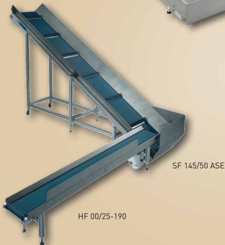
SF 145/50 ASE