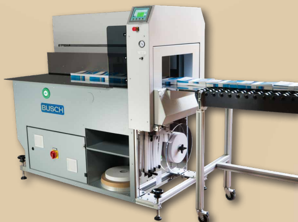
ZFB 32/75 R

Equipped with an integrated feed pusher and pneumatic compression of packages. Banding is performed with banderoles made of coated kraft paper and PP foil in 30 mm width. The machines are characterized by an extremely productive mode of operation.