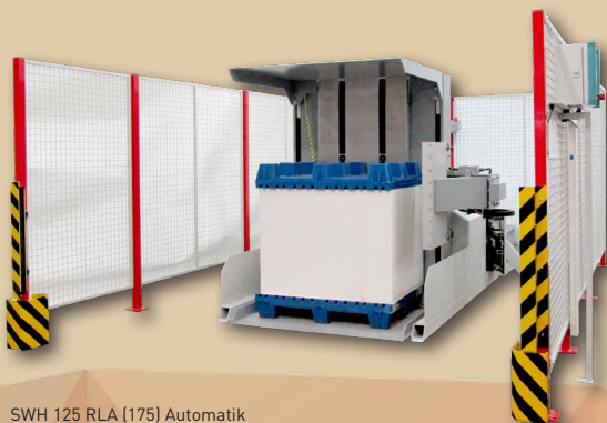
SWH 125 RLA (175) Automatik