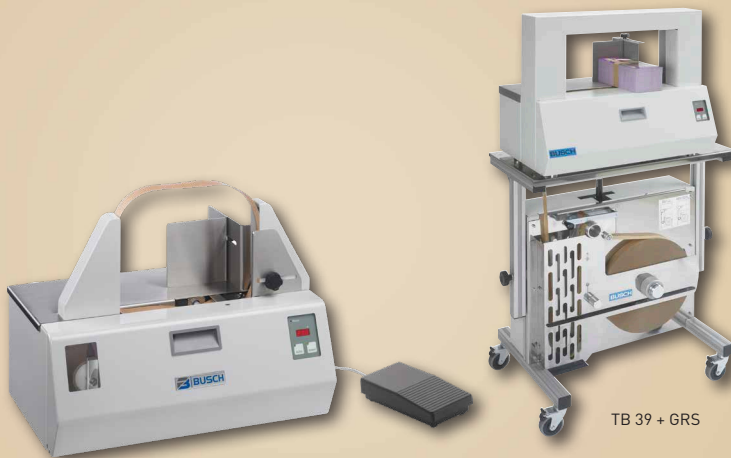
TB 26 I

Versatile, easy to operate and PCB-controlled – the BUSCH Table Banding Machine is ideal for banding all kinds of print products, bank notes and much more with coated kraft paper or PP foil in tape widths of 20, 30, 40 and 50 mm. For banding larger quantities the mobile and height-adjustable Large Reel Stand (GRS) is a suitable option.