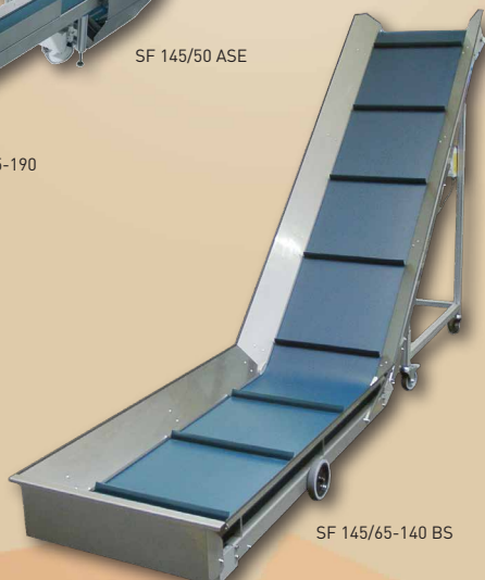
SF 145/65-140 BS