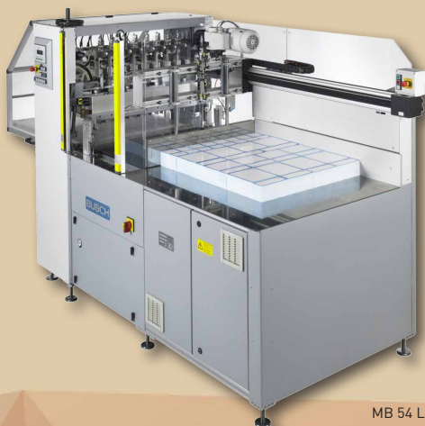
MB 54 L

Maximum feeding sizes: 540 x 1040, 740 x 1040, 1040 x 1040 mm.